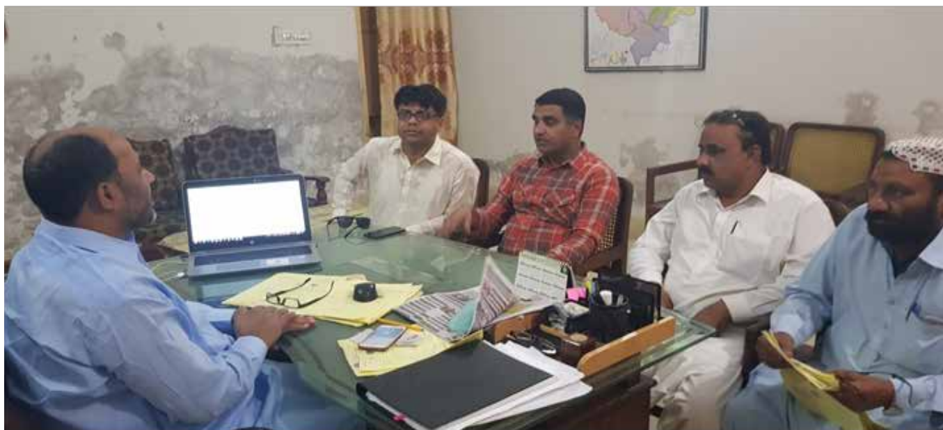
Party members meet with District Election Commissioner for Voter Registration Campaign in Kamber/Shahdadkot District