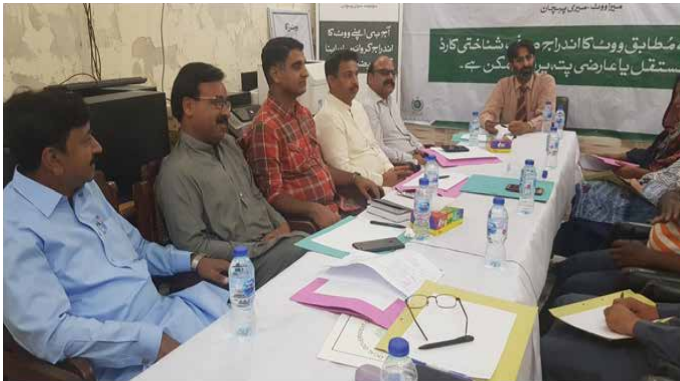
Division level activities of Pakistan Green Party

people from the COVID-19 pandemic by not holding public gatherings across the country.