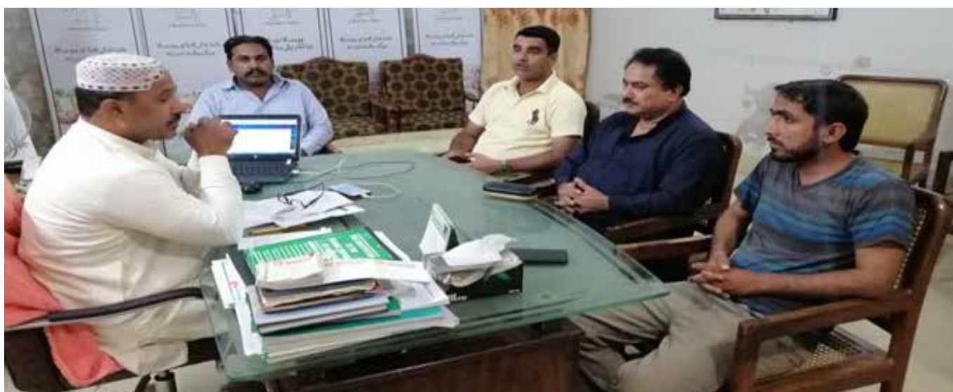
Party President attends Electoral Reforms Committee meeting about Local Government

Opposition parties have started anti-government campaigning since the government is going to conduct Senate (Upper House) elections in February 2021 before one month of its schedule. The government has been emphasizing the opposition parties to protect